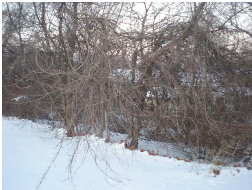
Photo 2. Overgrown branches and trees covering the outfield fence.