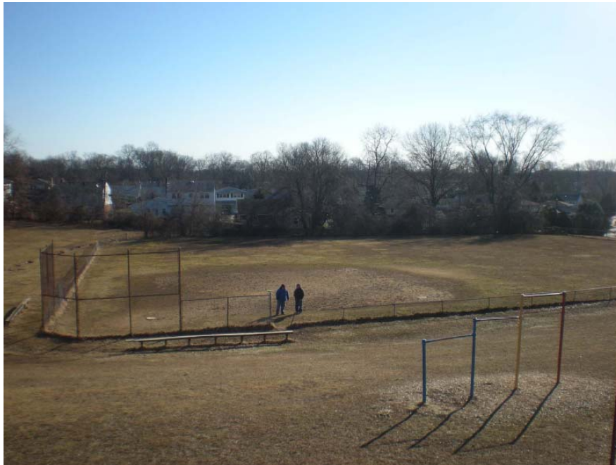
Photo 1. Current view of kickball field at Heritage Elementary School.