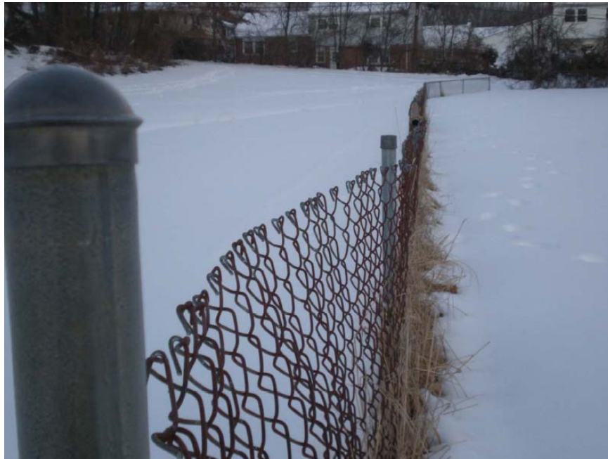
Photo 3. Broken fence with overgrown weeds at the base.