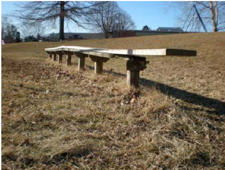
Photo 4. One of two benches behind backstop with an attempt to repair broken section.